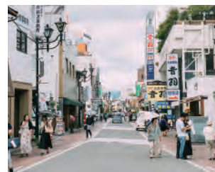
Castle Town Street

Odawara is known for its scenic beauty embracing both mountains and the sea, and is also the entrance into Hakone. It is accessible by regular train from Tokyo, Shinjuku, and Shibuya without transit, as well as by Shinkansen or the Bullet Train. The highlight of Odawara is Odawara Castle, one of the largest castles from the Sengoku Period. It was said to be invincible, withstanding invasions and thwarted the efforts to unify Japan. At Odawara Castle you can dress as a Samurai and take photos with the castle in the background, while feeling a sense of Bushido, the Samurai chivalry. The panorama from the castle tower is something impossible to see in Tokyo. Odawara is full of unique contents that central Tokyo does not offer, such as its rich nature and lingering sense of once-prosperous castle town. If you are headed to Hakone, you will not want to miss stopping at Odawara.