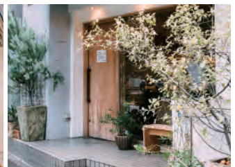
Local Popular Cafe