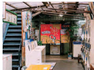
Retro Public Bath